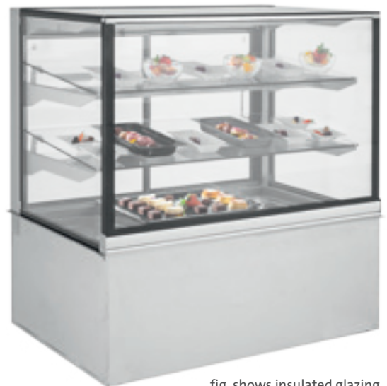
fig. shows insulated glazing